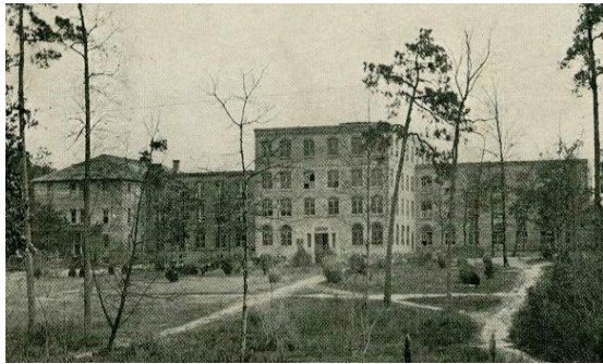
FMC Archive, Red Springs

These two dedicated educators continued to work side by side for thirty-four years and under their leadership the college flourished and gained widespread prestige and recognition. The original frame building was soon replaced with the imposing brick edifice that stands today. In 1916, in recognition of the Scottish heroine who had lived nearby and in deference to the overwhelming Scots influence in the area, the school assumed the name Flora Macdonald College.