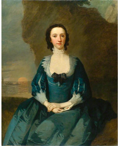
National Portrait Gallery, London

In 1779, Flora returned home to Scotland in a merchant ship which was attacked by a privateer en route. She refused to leave the deck during the attack and was wounded in the arm. Flora resided at the homes of various family members until Allan returned to Scotland and the family settled again at Kingsburgh. She died on the Isle of Skye in 1790, at the age of 68 and is buried there in the Kilmuir Cemetery.